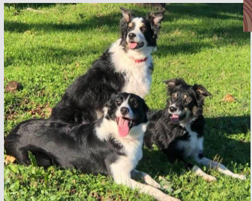
Dogs with sheep sense.