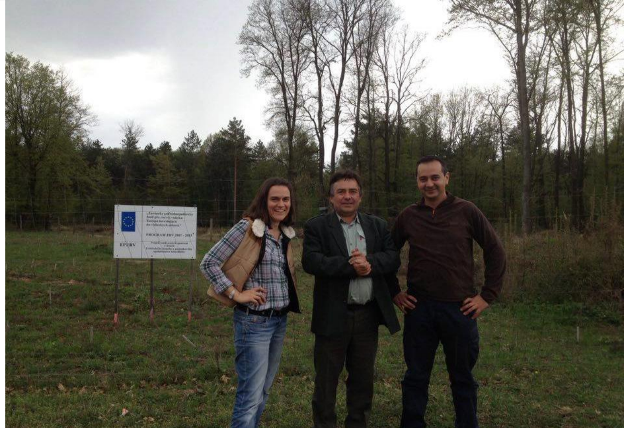
Cypriot foresters placement