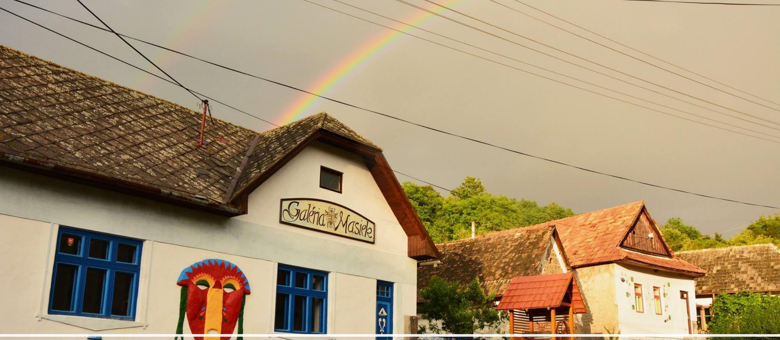
Mask Gallery Opening Ceremony 22.7.2017