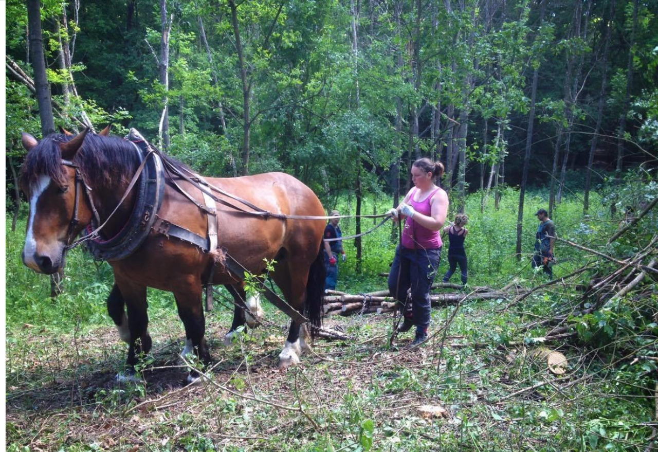
Horse logging in local forest