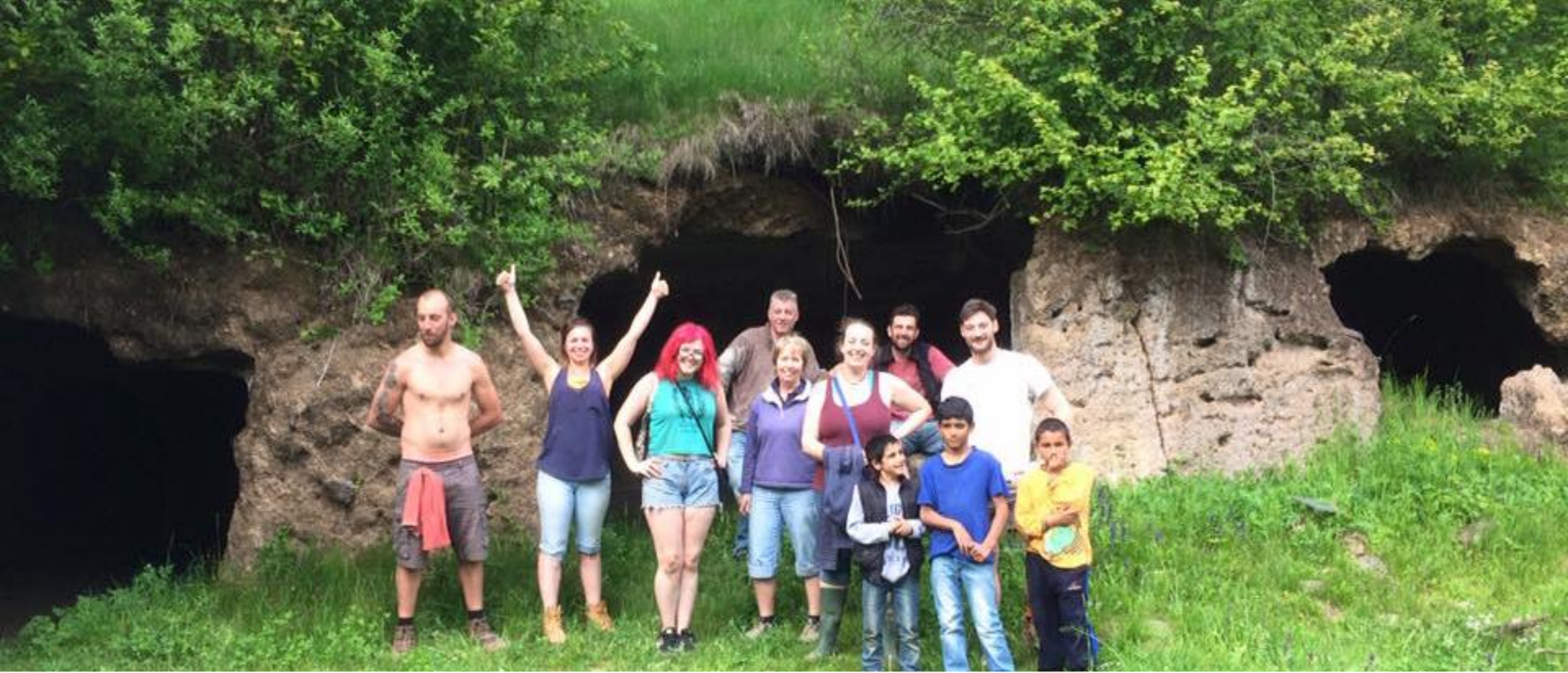
Exploring village in free time with villagers